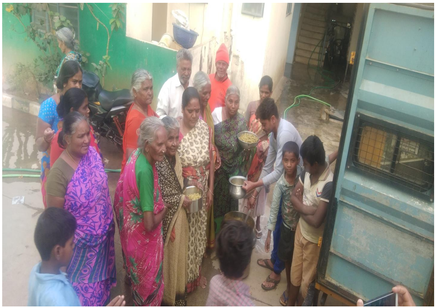
Feeding for senior citizens at Sanjay Gandhinagar Laggere, Bangalore-560058