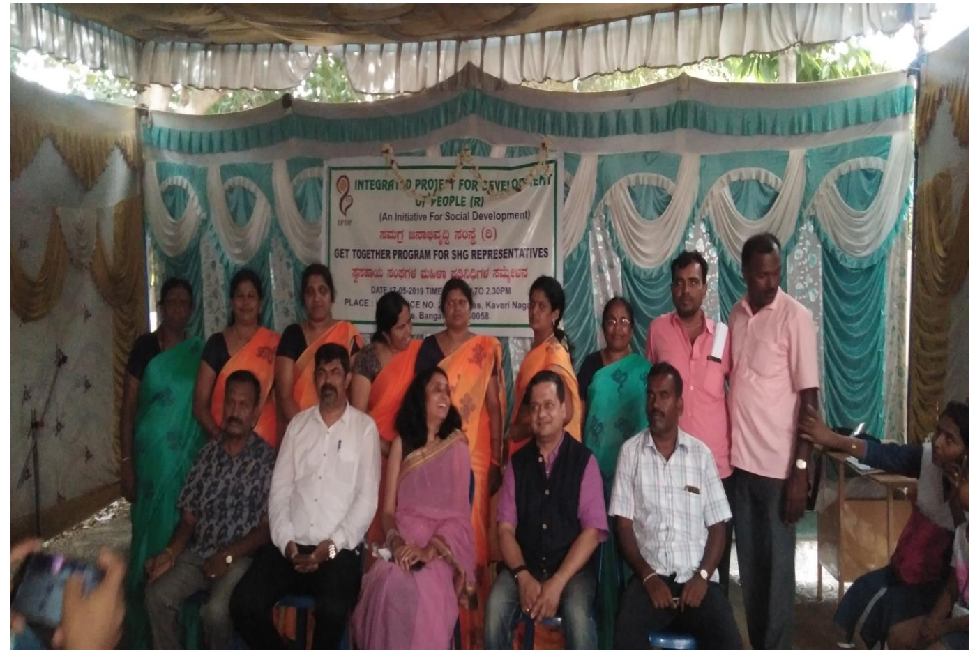
IPDP Staff Team with Donor Organization during get together program of SHG Representatives