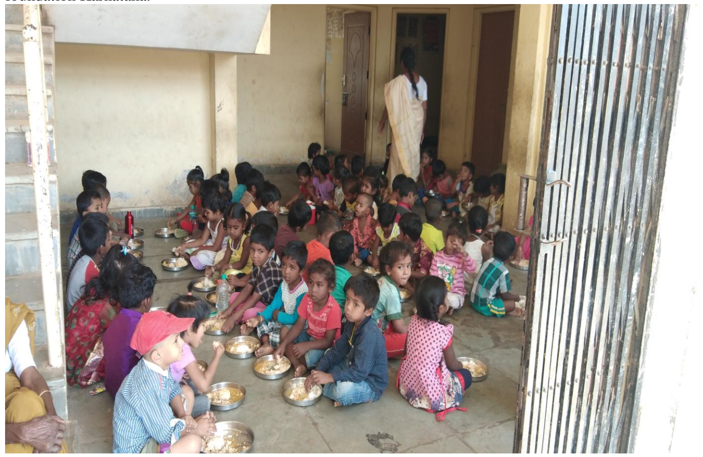
PPC pre primary education Center children having nutrition food in the center at Jaibhuvaneshwari nagar.

in the nearby areas. IPDP has set its target to enroll the poor children in Creche so that they are not deprived from their birth rights. We are running this program to help the working women and to educate the people in slums to send their children for formal education. It helps in eradicating malnutrition and it also creates a good awareness for education and health aspects. The health checkup camps are also initiated for providing effective medical treatment to the crèche center. Around 125 children are getting benefit under this program on an annual basis. This project is supported by MCKS food for the Hungry foundation Karnataka.