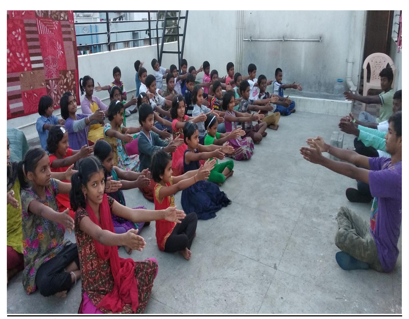
Ashakirana hostel Children in the Morning exercise as a healthily practice at shelter

Ashakirana residential shelter was started at Jaibhuvaneshwari nagar in 2006 especially for the poor children with the support of Sarva Shikshana Abhiyana SSA government of India. The main aim of the scheme is to main stream the children who are out of school in Bangalore urban District and the Ashakirana residential shelter for "Children in Crisis" shifted from Jaibhuvaneshwari nagar, to No.2, 1st cross Kaveri nagar, Laggere Bangalore 560058 for 58 to 60 children and presently 56 children are benefiting from this project and enrolled in Mother Theresa school from 2nd Standard to 10th Standard and continuing their studies. They are provided with all sorts of facilities such as food, clothing, recreation, education and other required facilities. The main background of the children are from alcoholic families, broken families, single parents and other children facing various sorts of problems and which children are really needed support for continue their studies incase if we do not give admission then they stop their education and they go for work or simply waste their time and their future, therefore we approached our Donors and continuing the Ashakirana shelter for poor children since last 13 years. The shelter provides individual stay rooms for boys and girls And the Residential Shelter is supported by MCKS TRUST FUND for feeding of children and WEIR MINERAL INDIA for Maintenance of Salary and other requirements