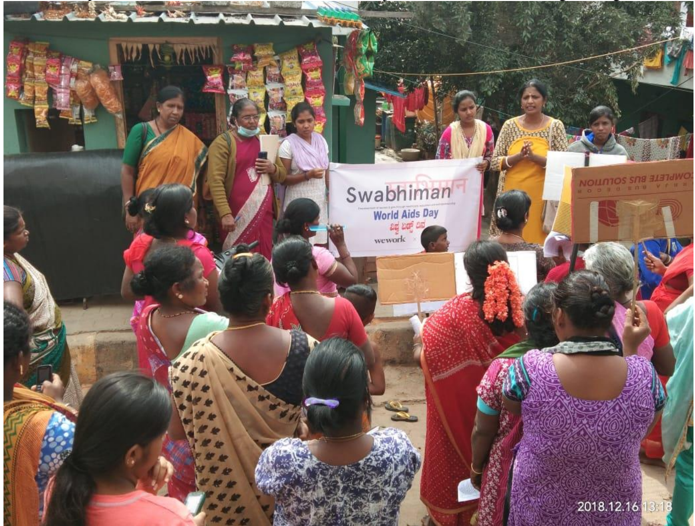
Aids awareness program rally in the project Area at Jaibhuvaneshwari nagar, Bangalore -96

We Work Representative has launched the Swabhiman Project at Jaibhuvaneshwari nagar, Bangalore -96