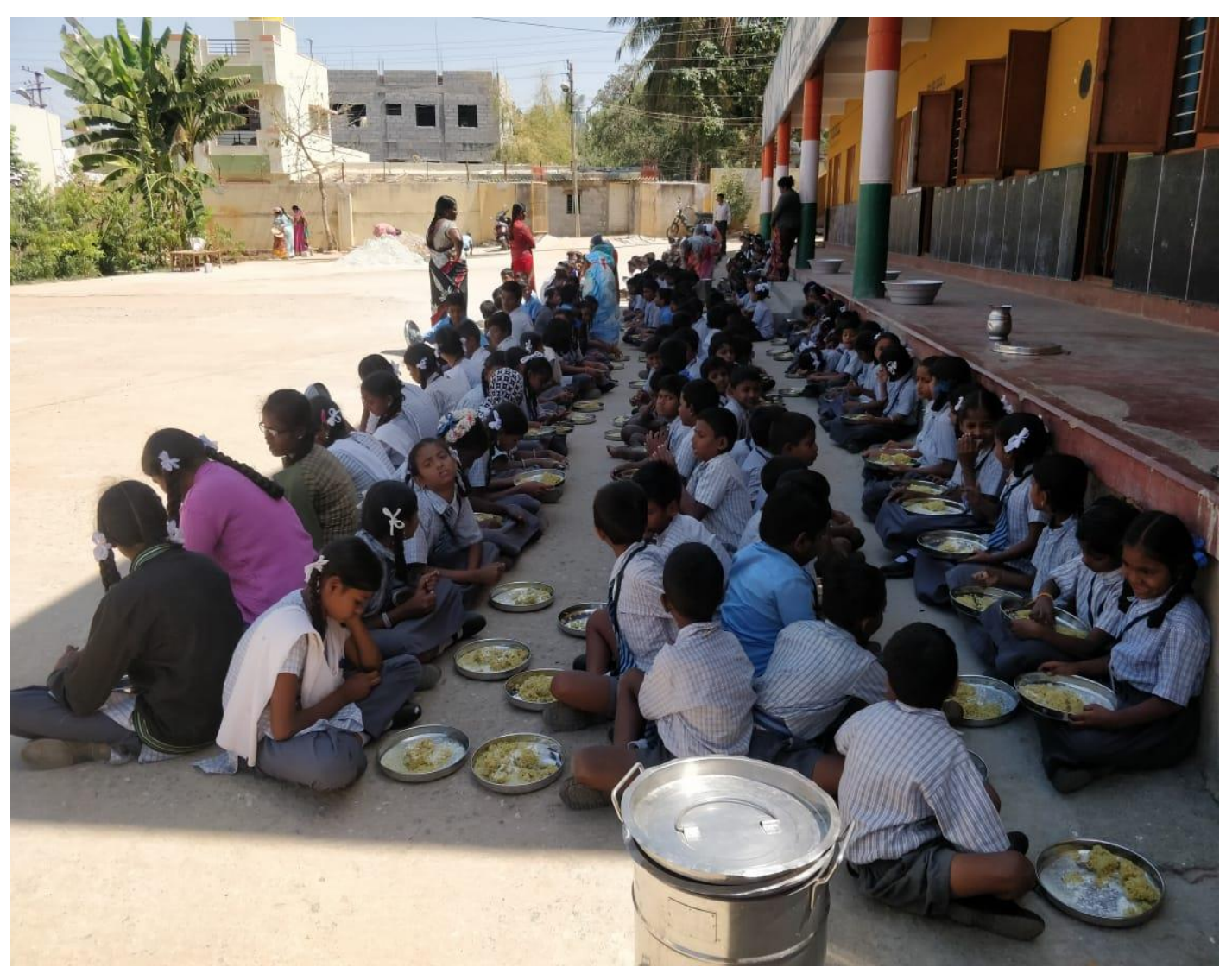
GOVERNMENT SCHOOL CHILDREN SERVED MID DAY MEAL AT BANGALORE URBAN DISTRICT.