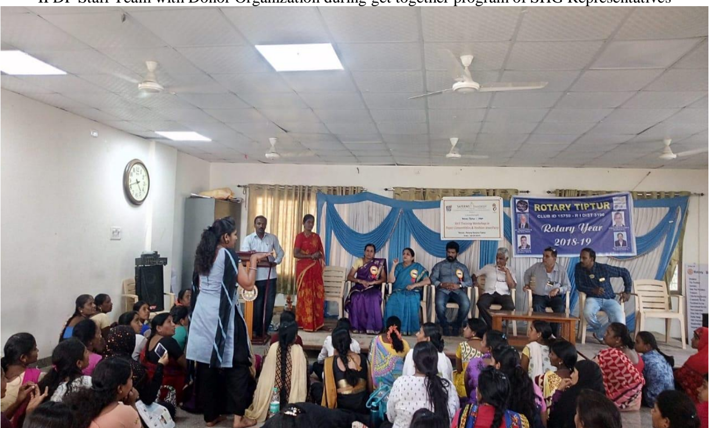
Skill Training program organized for SHG representative at Tiptur with Rotary and Safewe foundation