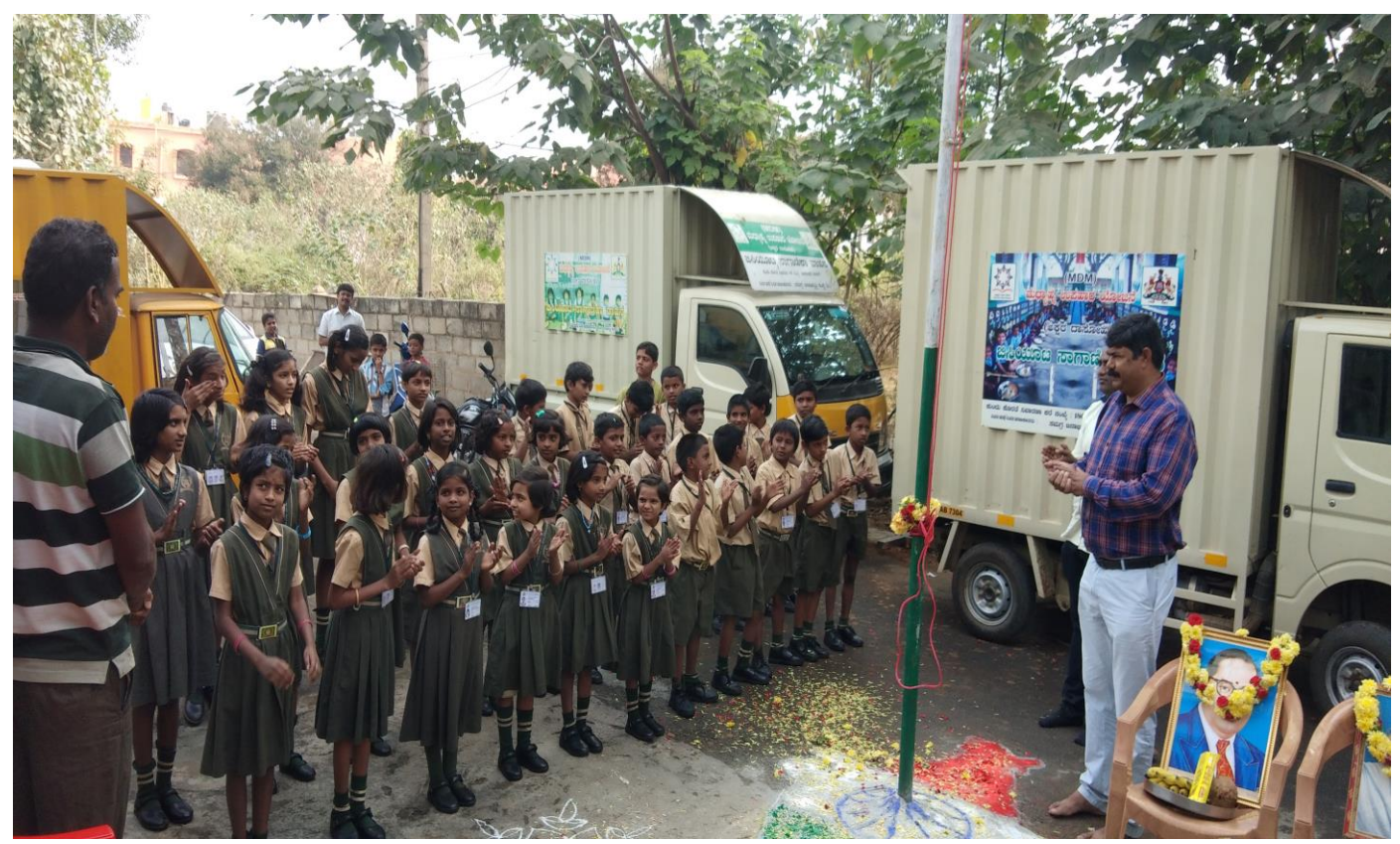
Celebration of Independence Day with Ashakirana children at hostel premises