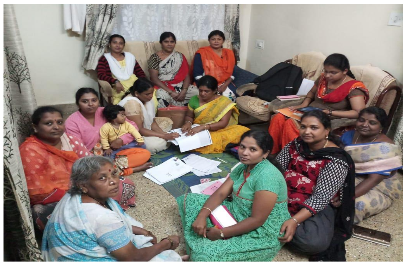
SHG group meeting at Area Our Coordinator is conducting meeting and updating books of records